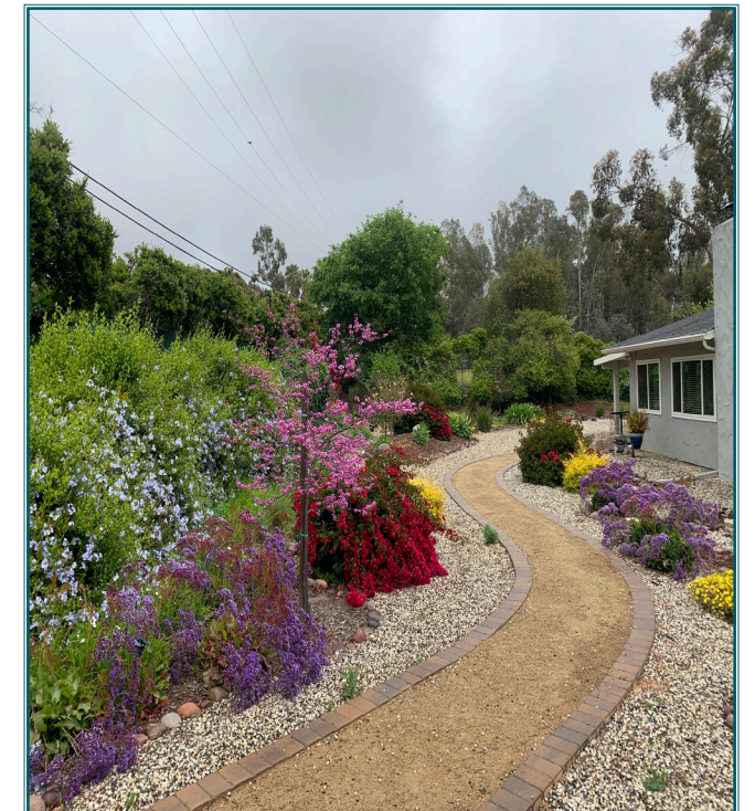
The Wagemester's s transformed landscape.