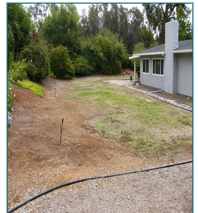
The Wagemester's back yard before the makeover.