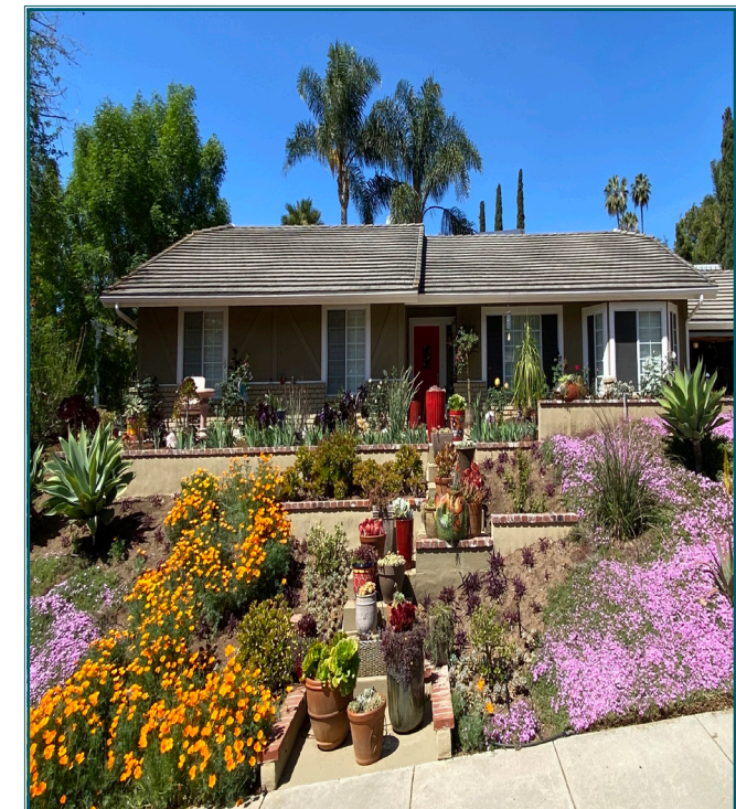
Lauren Grey's WaterSmart landscape.